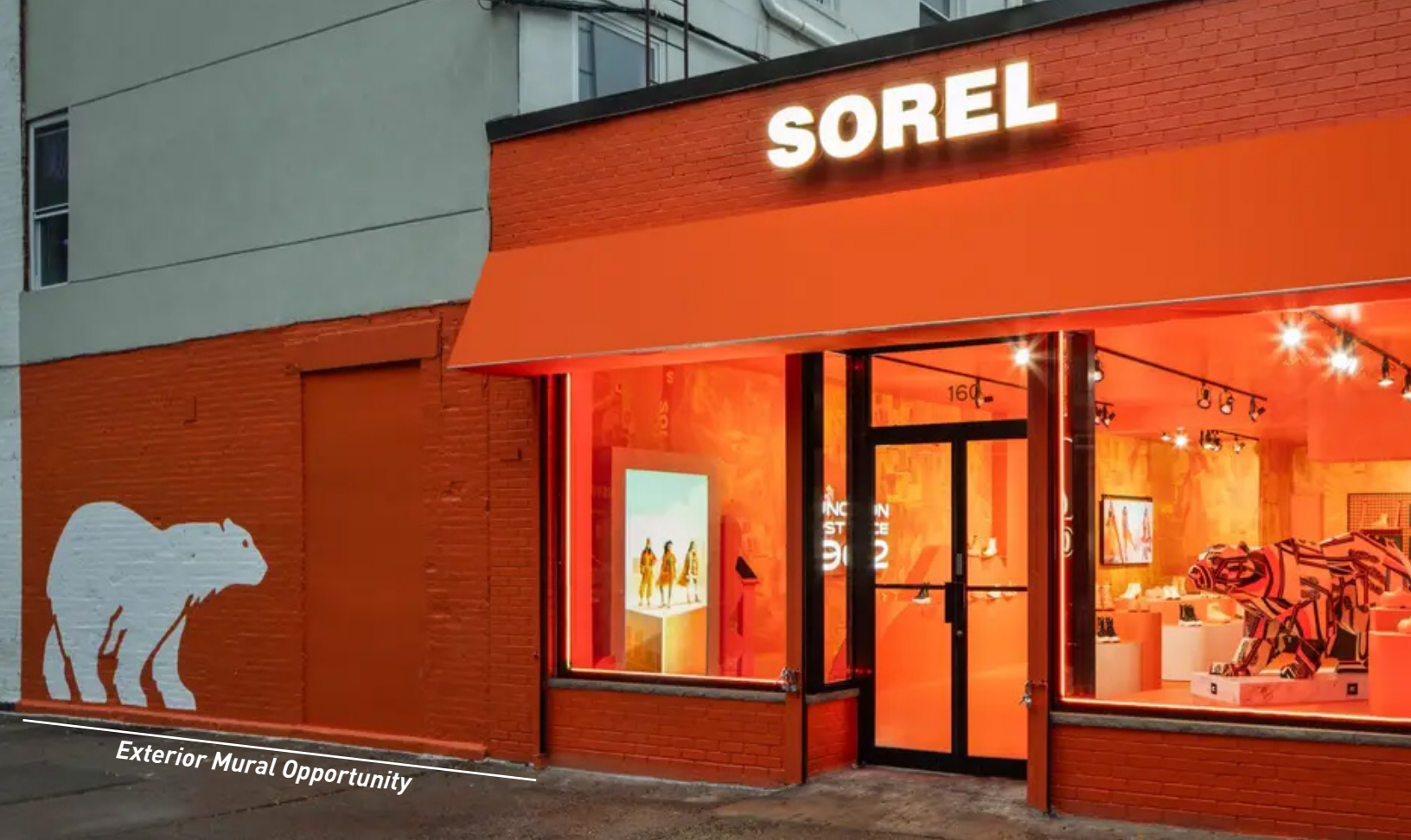
Exterior Mural Opportunity